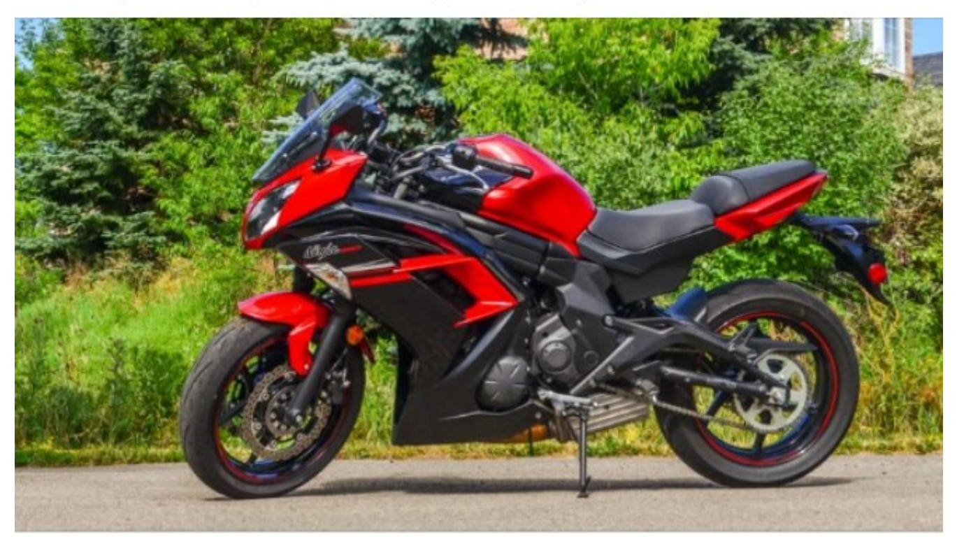
This is the GPZ400 the Ninja 650 will be replacing.

The development of the gear for lure coursing is never ending.